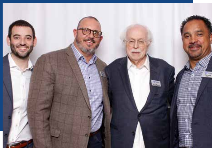
Valor had the honor of hosting Dr. Michael Baden for an event in Dublin, OH that focused on Dr. Baden's higher profile cases from his career, including the Jeffrey Epstein autopsy as well as his work on the JFK assassination. He was incredible!